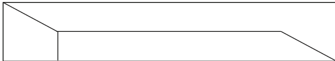
SCORE TILE AS SHOWN