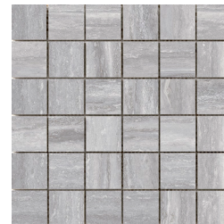
Trail 2"x2" on 12"x12" Mesh