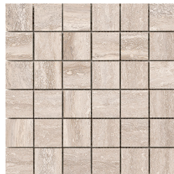
Pass 2"x2" on 12"x12" Mesh