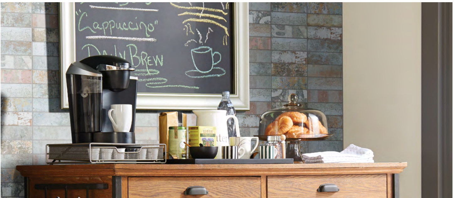
790 Warehouse Blend