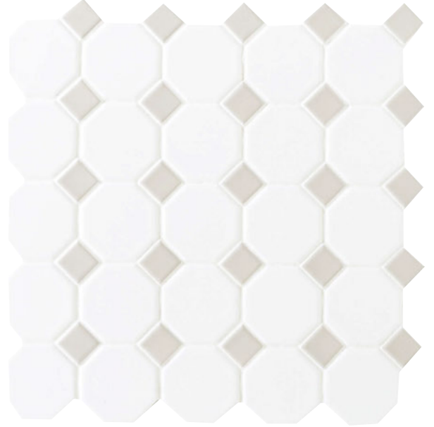
MATTE WHITE 6501 WITH 44 GRAY GLOSS DOT