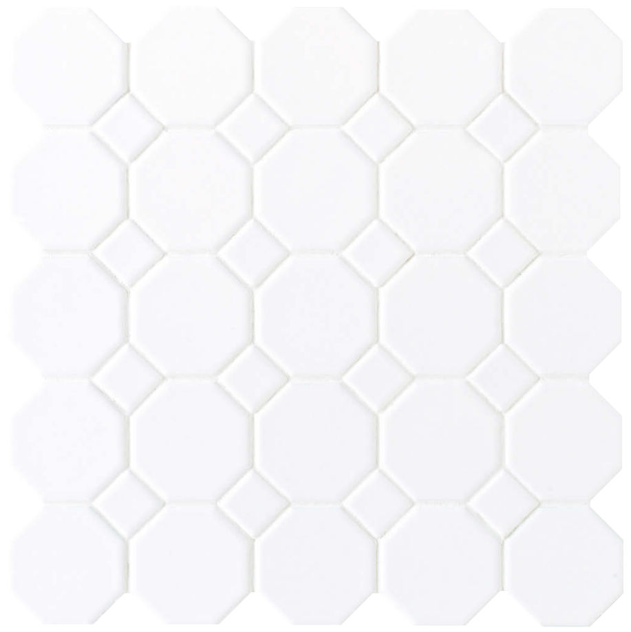
MATTE WHITE 6501 WITH 01 WHITE DOT