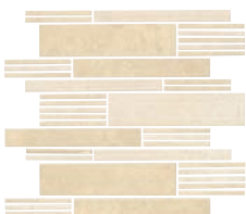
TORREON T711 Random Linear Mosaic* Polished, Honed & Scraped