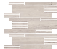
CHENILLE WHITE L191 Random Linear Mosaic* Polished, Honed & Scraped

* Mosaic can be cut into thirds to create interlocking decorative border