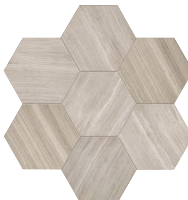
CHENILLE WHITE L191 18" x 20-3/4" Hexagon – Honed