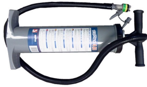
16" Hand Pump: Included with Air Floors, Sweet Spots, Jr. Sweet Spots & Launch Pads