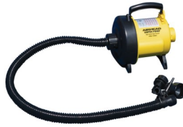
Airhead Superpump: Included with Air Floor PROs & Power Launch. Can be purchased separately for faster inflation/deflation.