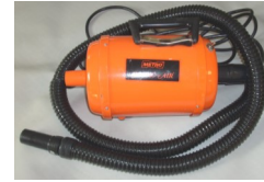
Magic Air Deluxe Electric Blower: Purchased separately for faster inflation/deflation.